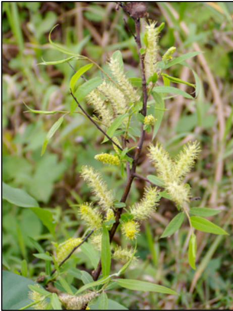
Coastal plain willow