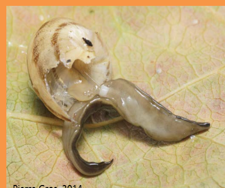
Pierre Gros, 2014

Report Possible Sightings With a Photo and GPS Coordinates if possible!