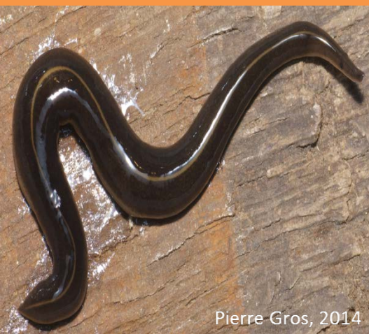
Pierre Gros, 2014