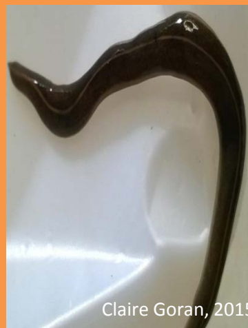
Claire Goran, 2015