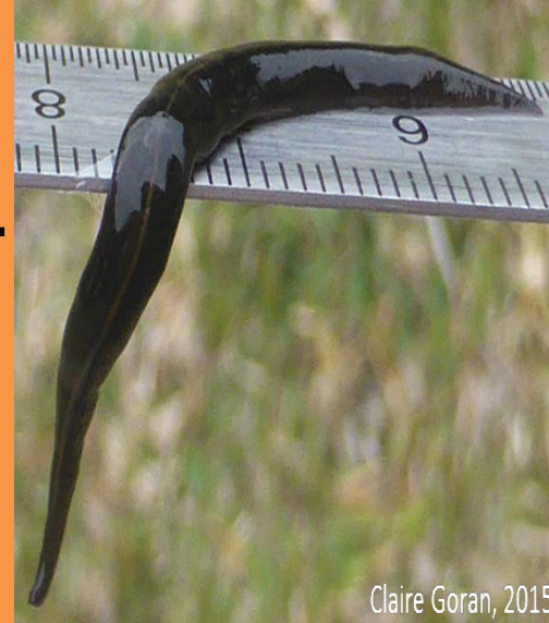
Claire Goran, 2015